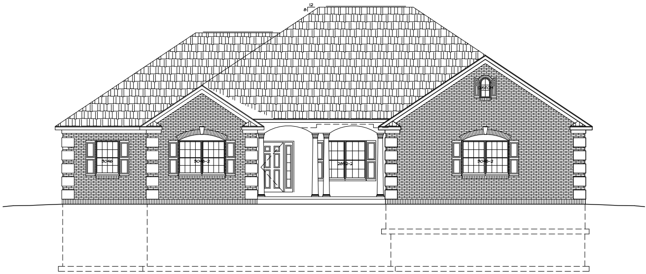
1 FRONT ELEVATION A-1 SCALE: 1/4"=1'-0"